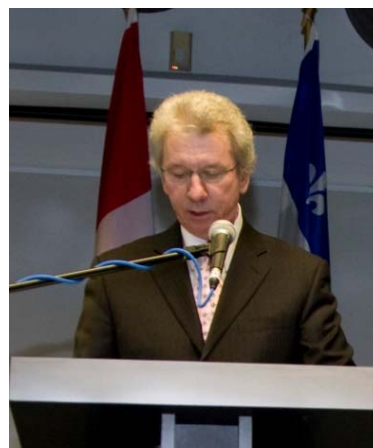
Jean-Pierre Blackburn Minister of National Revenue