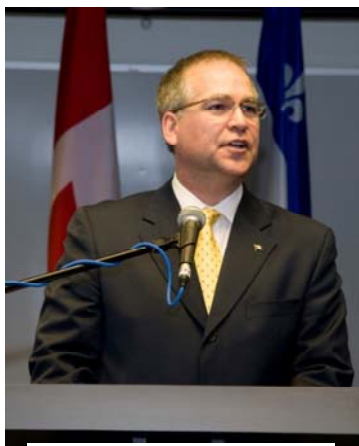
Gary Goodyear Minister of State – Science and Technology